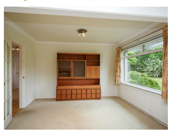
(at widest points)