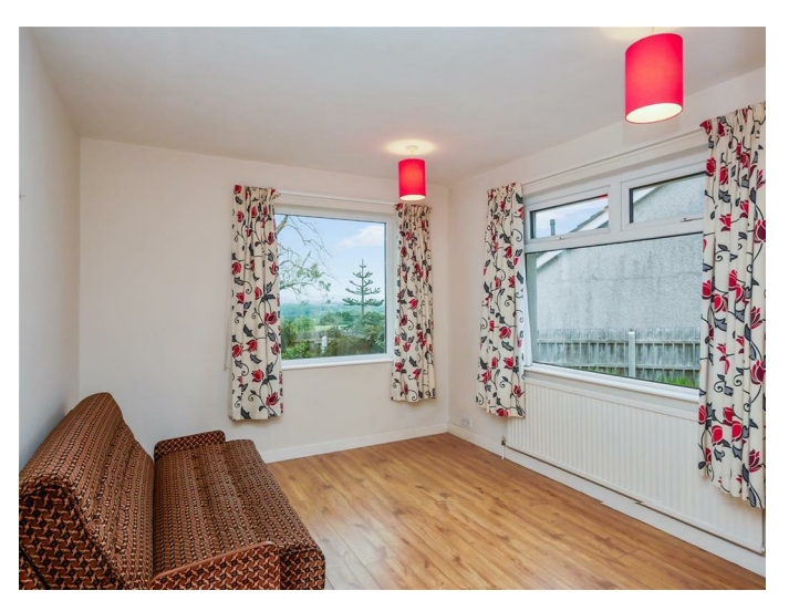
Laminate flooring. Lovely views.