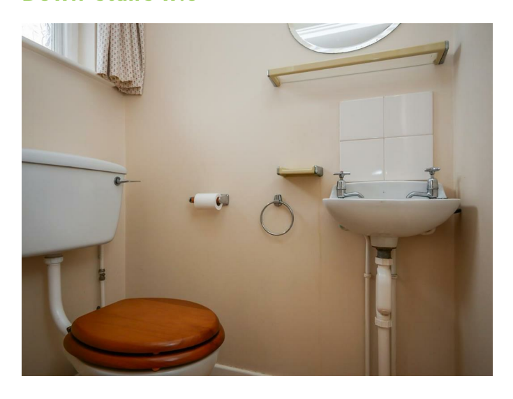
Sink unit, low flush w.c.