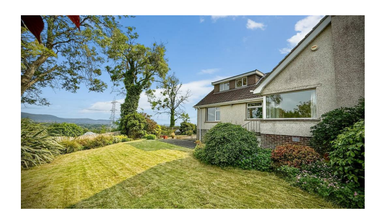
Attached Garage 15'2 x 9'9 (4.62m x 2.97m ) Up and over door. Light and power. Housing oil boiler.