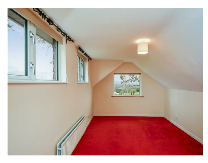
At widest points. Lovely views to the rear.