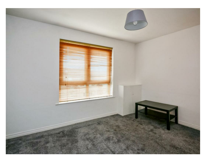
Bedroom Two 11'11" x 9'1"

Comprising corner shower cubicle with chrome shower unit, pedestal wash hand basin with mixer taps, low flush w.c, double Upvc doors to juliet balcony.