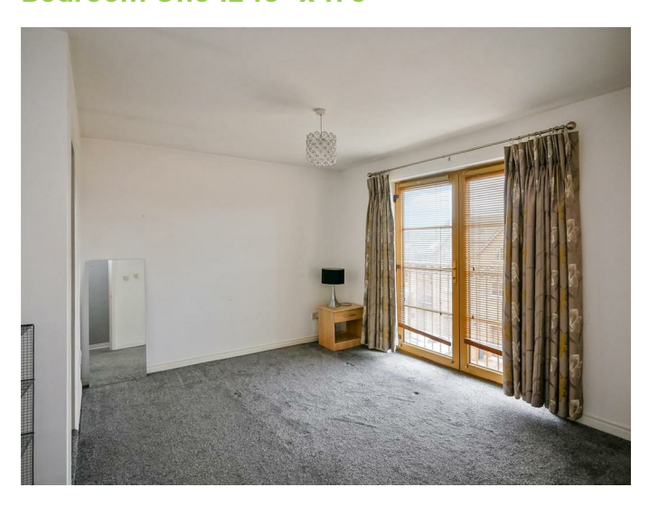
Double Upvc doors to Juliet balcony.