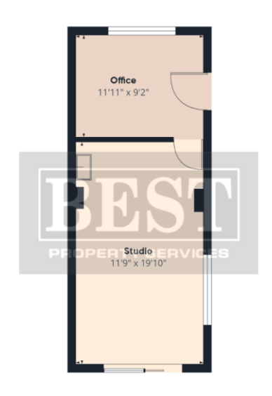
Floor 1 Building 2