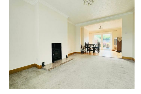
223 Jordanstown Road Jordanstown, Newtownabbey, BT37 OLX