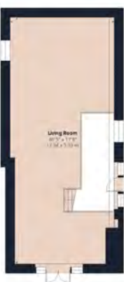
Floor 1 Building 2