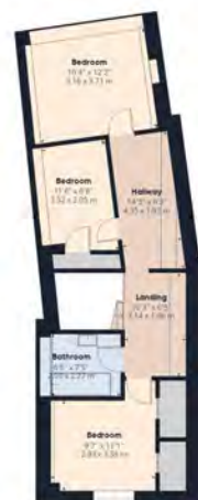
Floor 1 Building 5