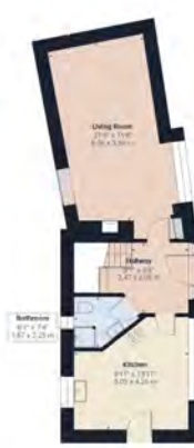
Floor 0 Building 5