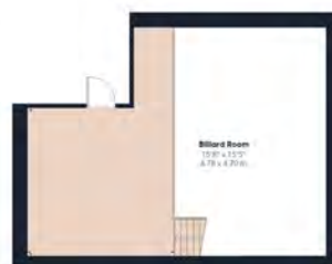
Floor 1 Building 4