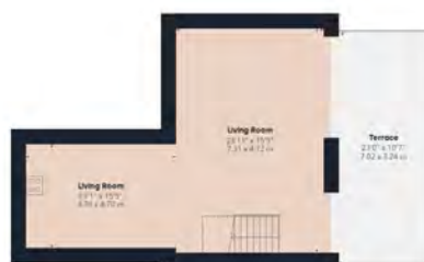
Floor 0 Building 4