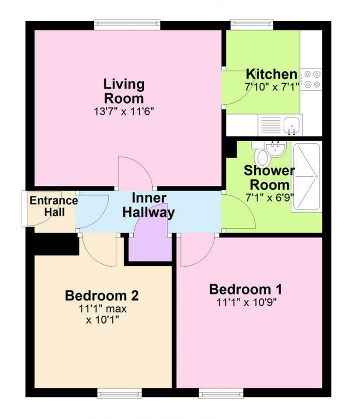
96 The Old Mill, Killyleagh