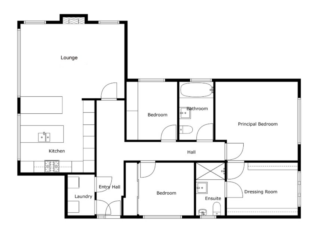
Sizes And Dimensions Are Approximate. Actual May Vary.

Heading out of the City on the Lisburn Road, Osborne Park is on the left hand side before the traffic lights at Balmoral Avenue.