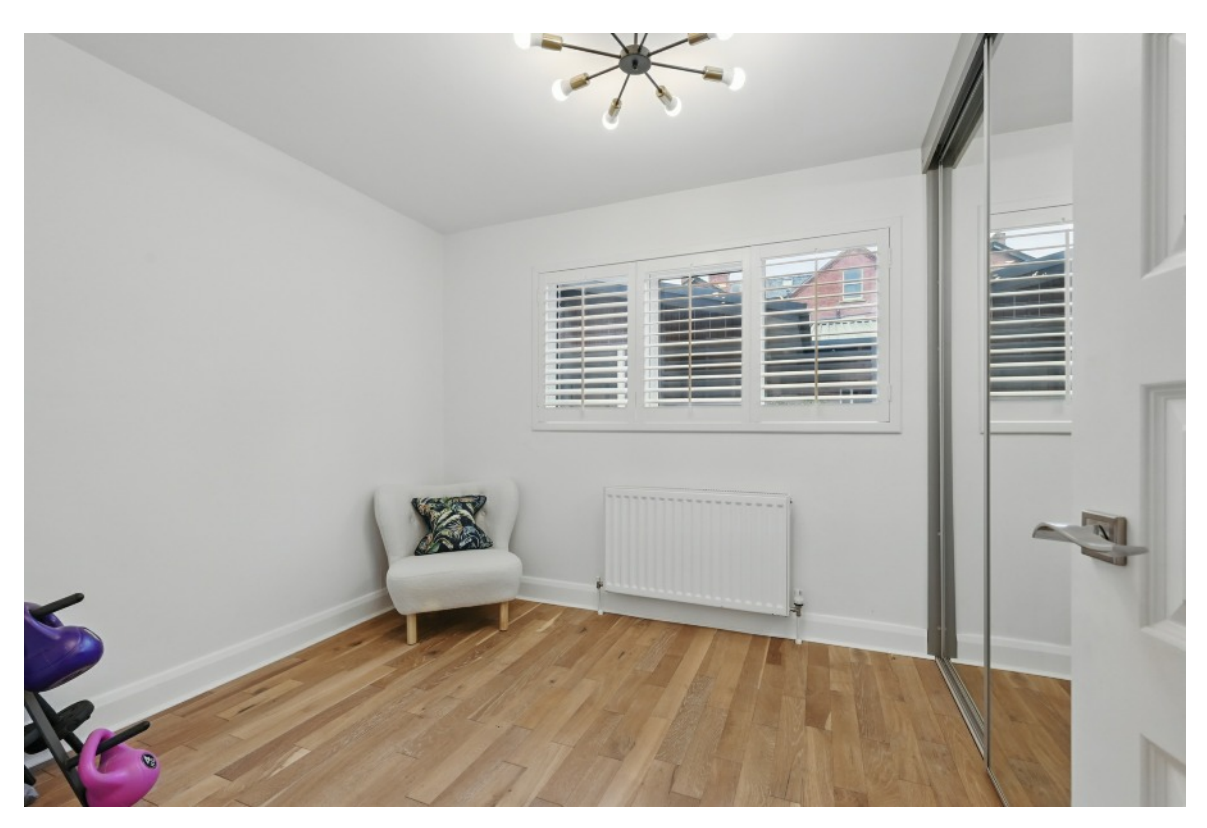
BEDROOM (2): 10' 0" \times 8' 2" (3.05m \times 2.49m) Wood floor, window shutters. Includes built-in Murphy Bed. Currently used as a home office with the flexibility of the pull down bed.

BEDROOM (3): 11' 5'' \times 8' 9" (3.48m \times 2.67m) (at widest points). Window shutters, built-in robe with mirror fronted doors. Wooden floor.