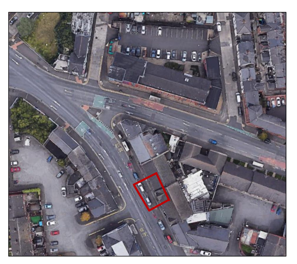
*line shown for indicative purposes only*