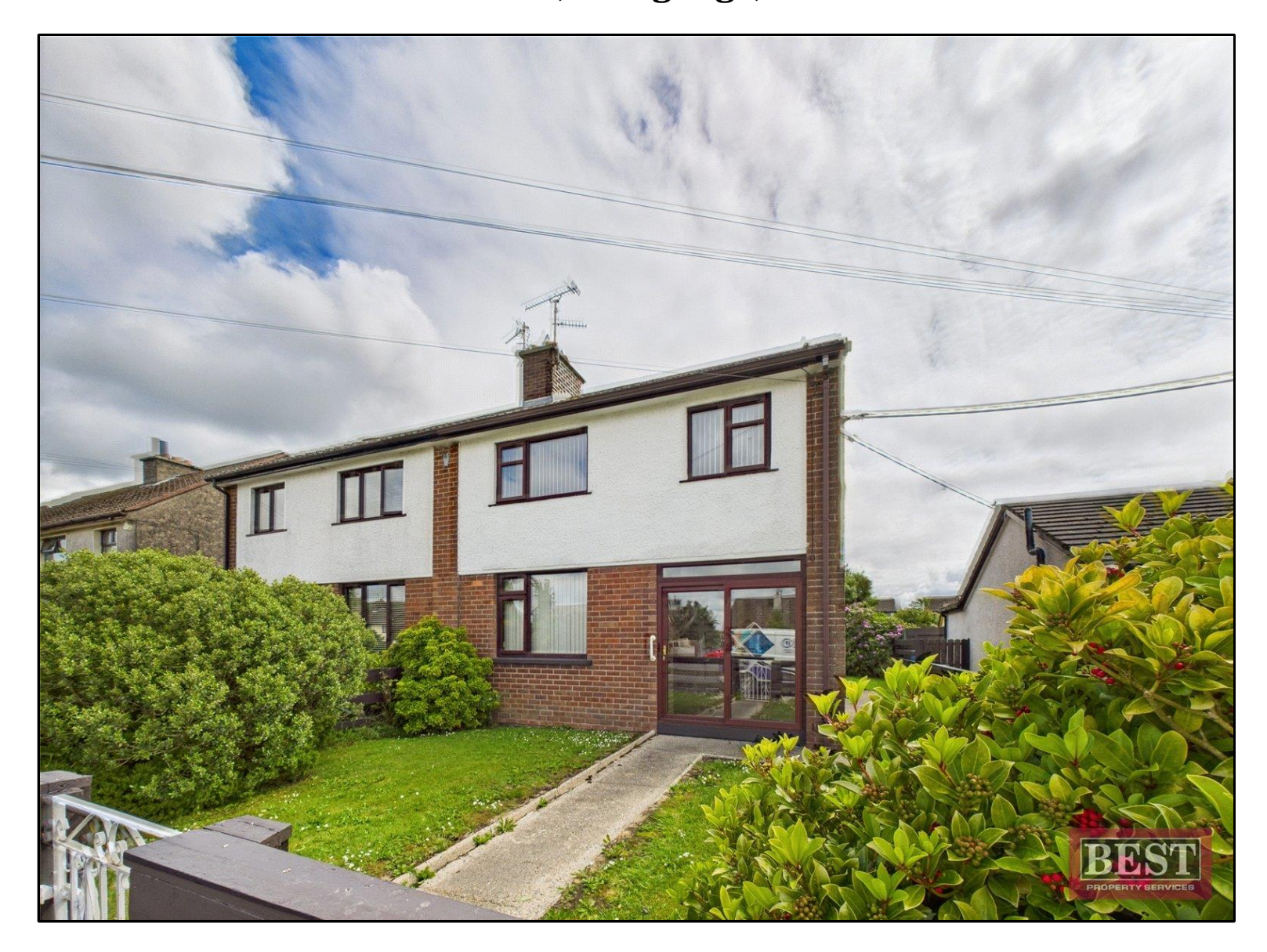
Asking Price £149,950