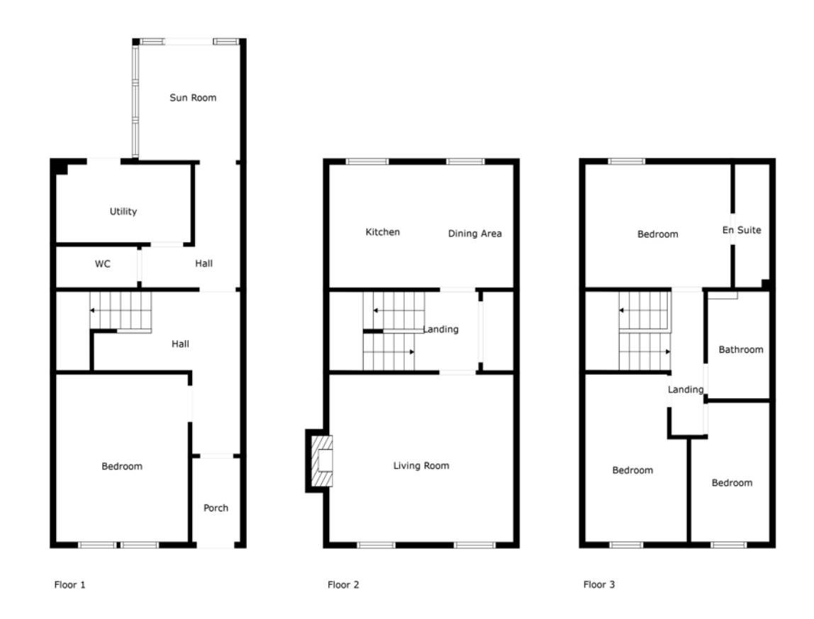
Floorplan Is For Illustrative Purposes Only And Is Not To Scale