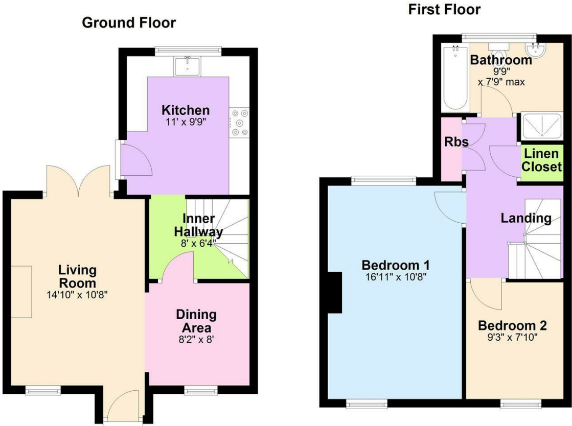
67 Gowdstown Road, Banbridge

If you require a viewing please get in contact via phone Leanne on 02840622226/07703612260 or email - banbridge@quinnestateagents.com