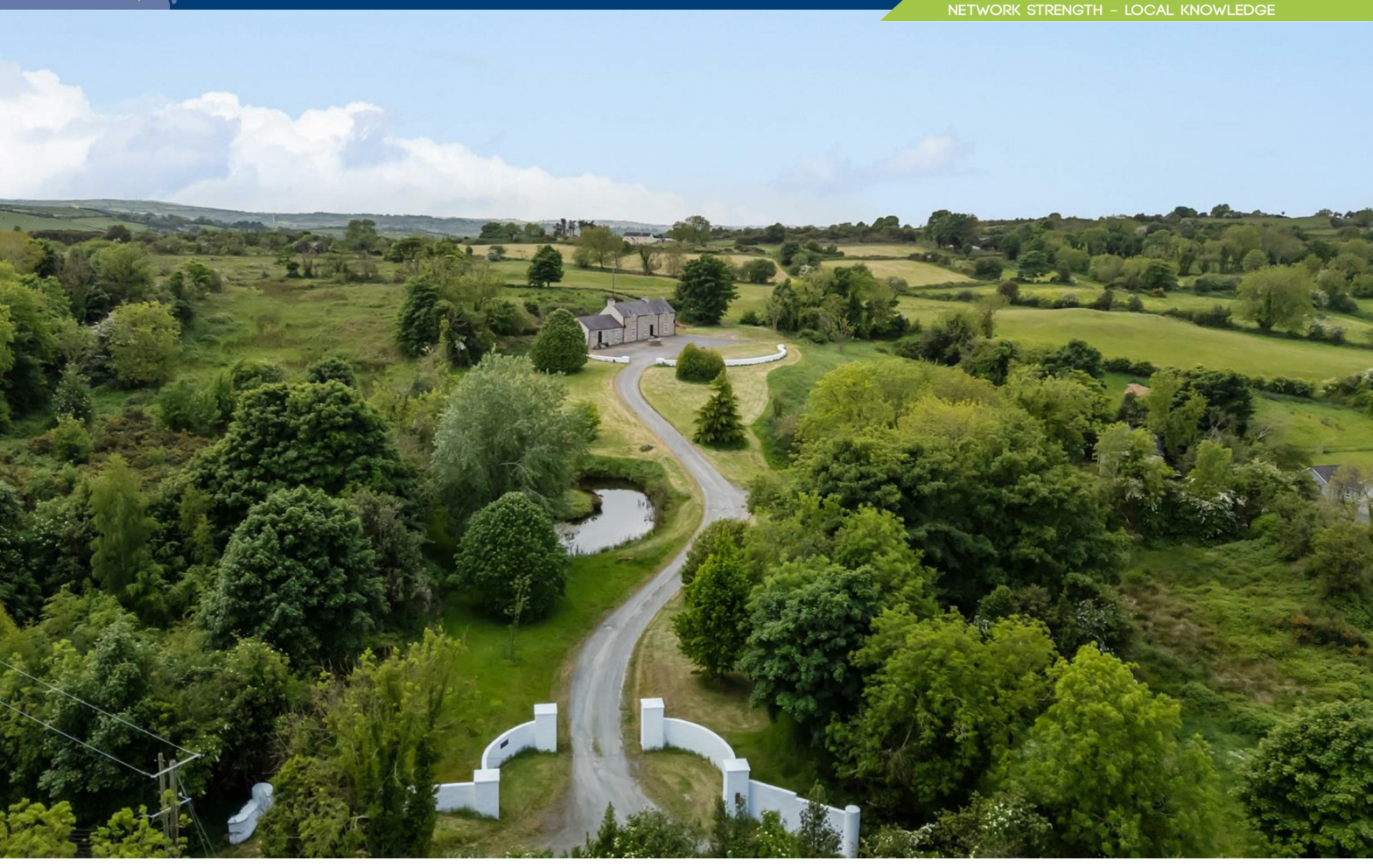
17 BURNPIPE LANE, BALLYNAHINCH, DOWN, BT24 8HY