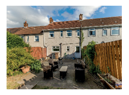
7 Torr Way