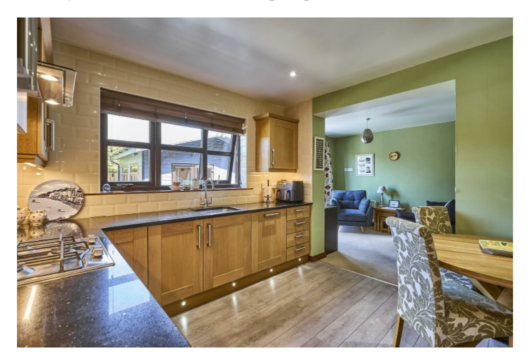
LIVING ROOM: 11' 6" x 9' 10" (3.5m x 3m) uPVC double glazed double doors to exterior.

KITCHEN: 10' 10" x 10' 6" (3.3m x 3.2m) Shaker style kitchen with excellent range of high and low level units, granite work surfaces and drainer, Blanco stainless steel sink unit with mixer tap, built-in Hotpoint electric oven and four ring gas hob, stainless steel extractor fan, built-in dishwasher. Tiled splashback, kickboard LED lighting.