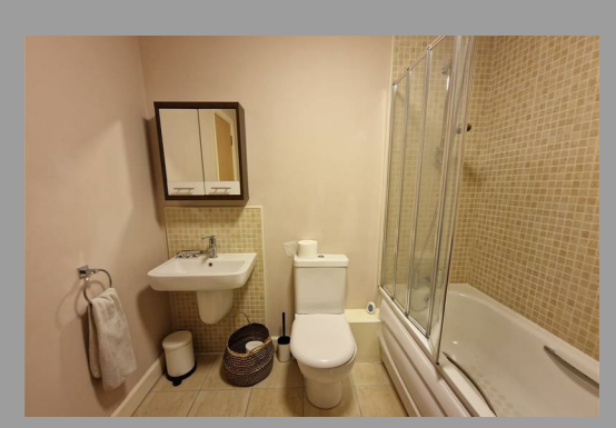
Lettings & Management 7 Pattons Lane Holywood Down BT18 9FX