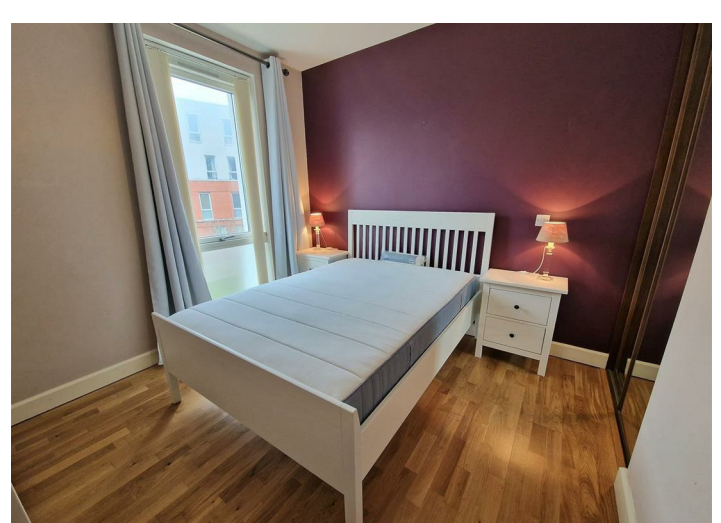
27 The Keel Building, Annadale Crescent