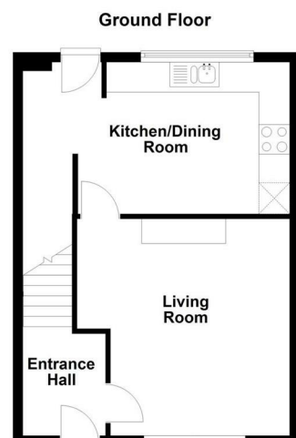
106 Salia Avenue, Carrickfergus