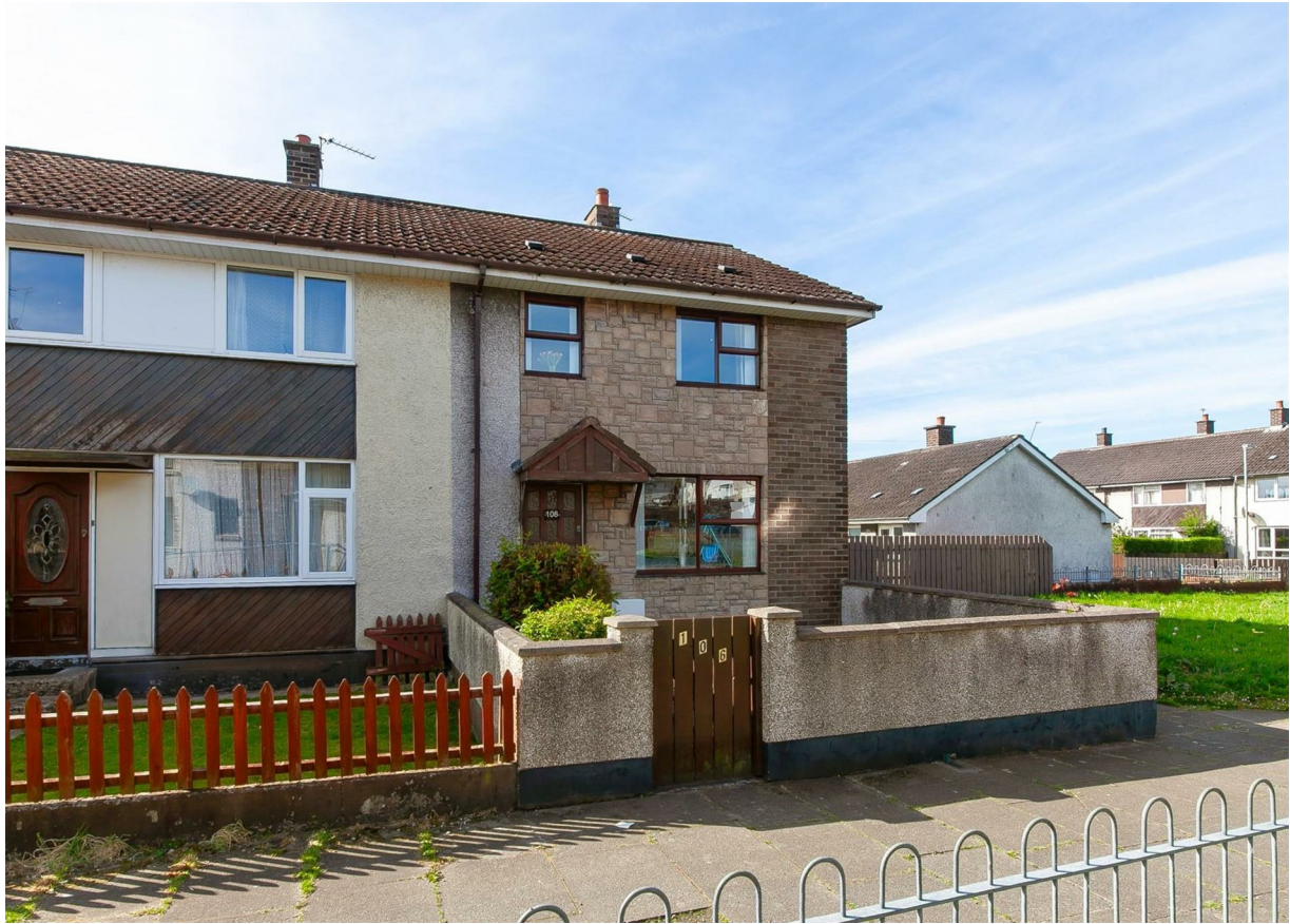
106 Salia Avenue, Carrickfergus, BT38 8NE