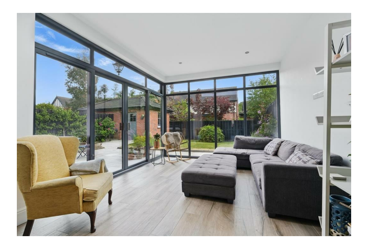
Aluminium double glazed door to rear garden. Roof light.