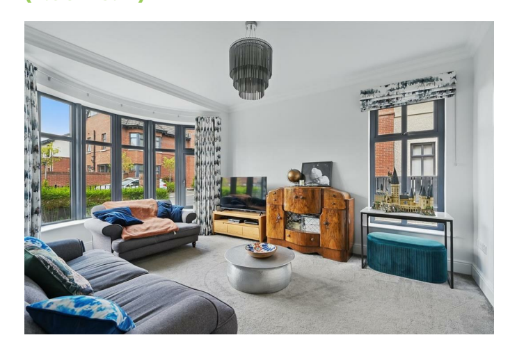
DRAWING ROOM (into bay) 16'0" x 12'2" (4.90 x 3.71)

Ceramic tiled wood effect floor, cornice ceiling.