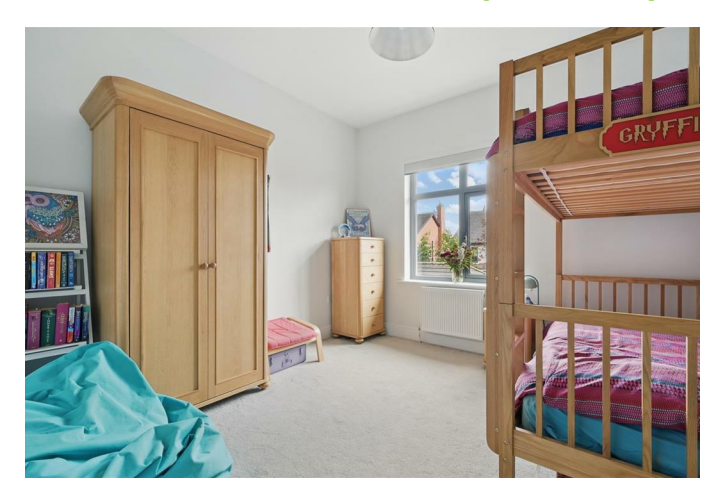
BEDROOM FOUR 10'4" x 8'2" (3.16 x 2.50)