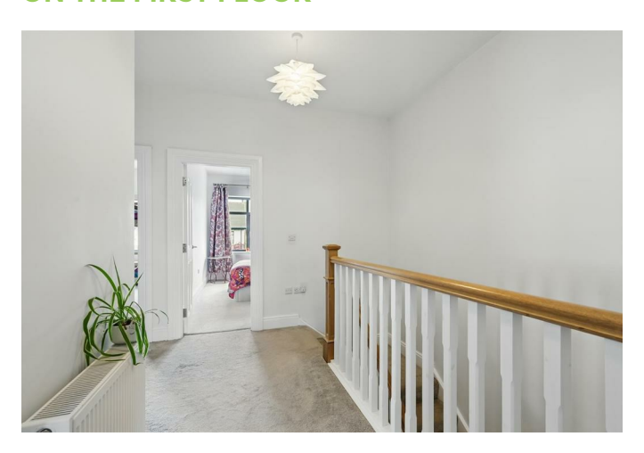
MASTER BEDROOM 13'5" x 12'2" (4.11 x 3.71)