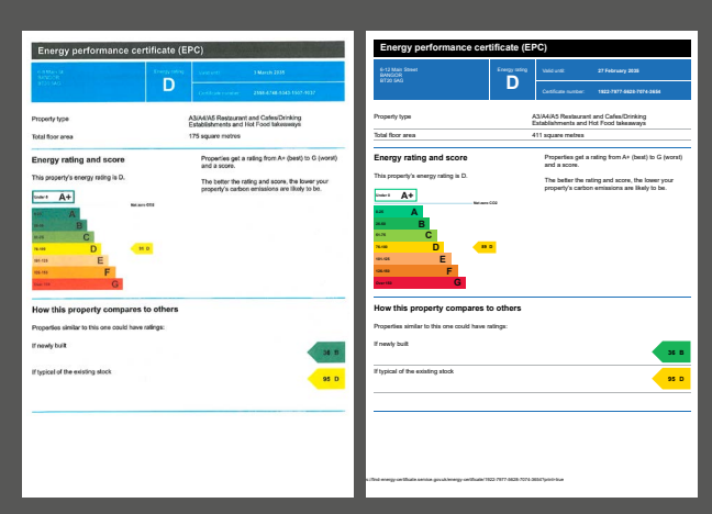
6-8 Main Street