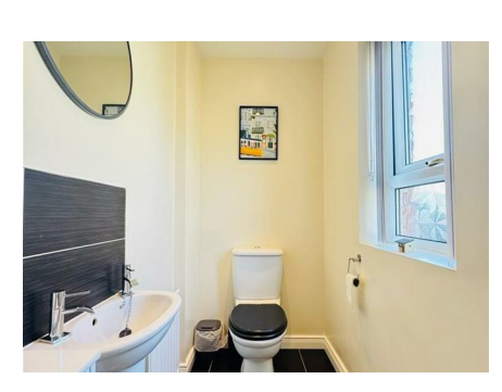
44 Alderley Place Mallusk Road, Newtownabbey, BT36 7WW