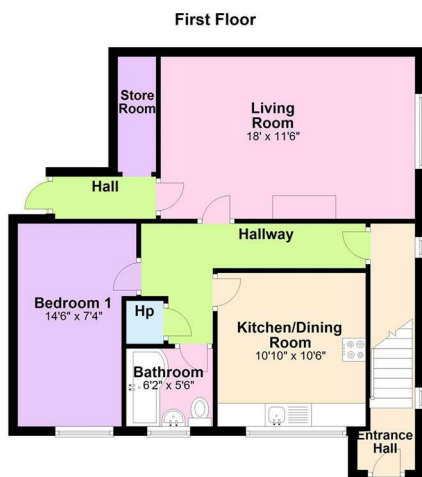
5D Leamont, Banbridge

Small fully enclosed front yard with low maintenance paving. To rear you have a communal area providing storage for bins and washing line.