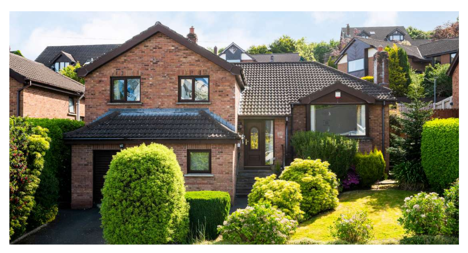
DETACHED | 4 ⊨ | 2 ≒ | 1 ⊟

We are delighted to bring to the market this deceptively spacious four-bedroom detached property in Gilnahirk, East Belfast.