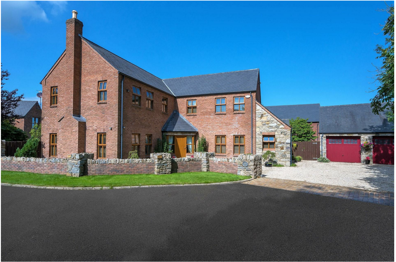
9 Carnbank, Templepatrick, BT39 0FB