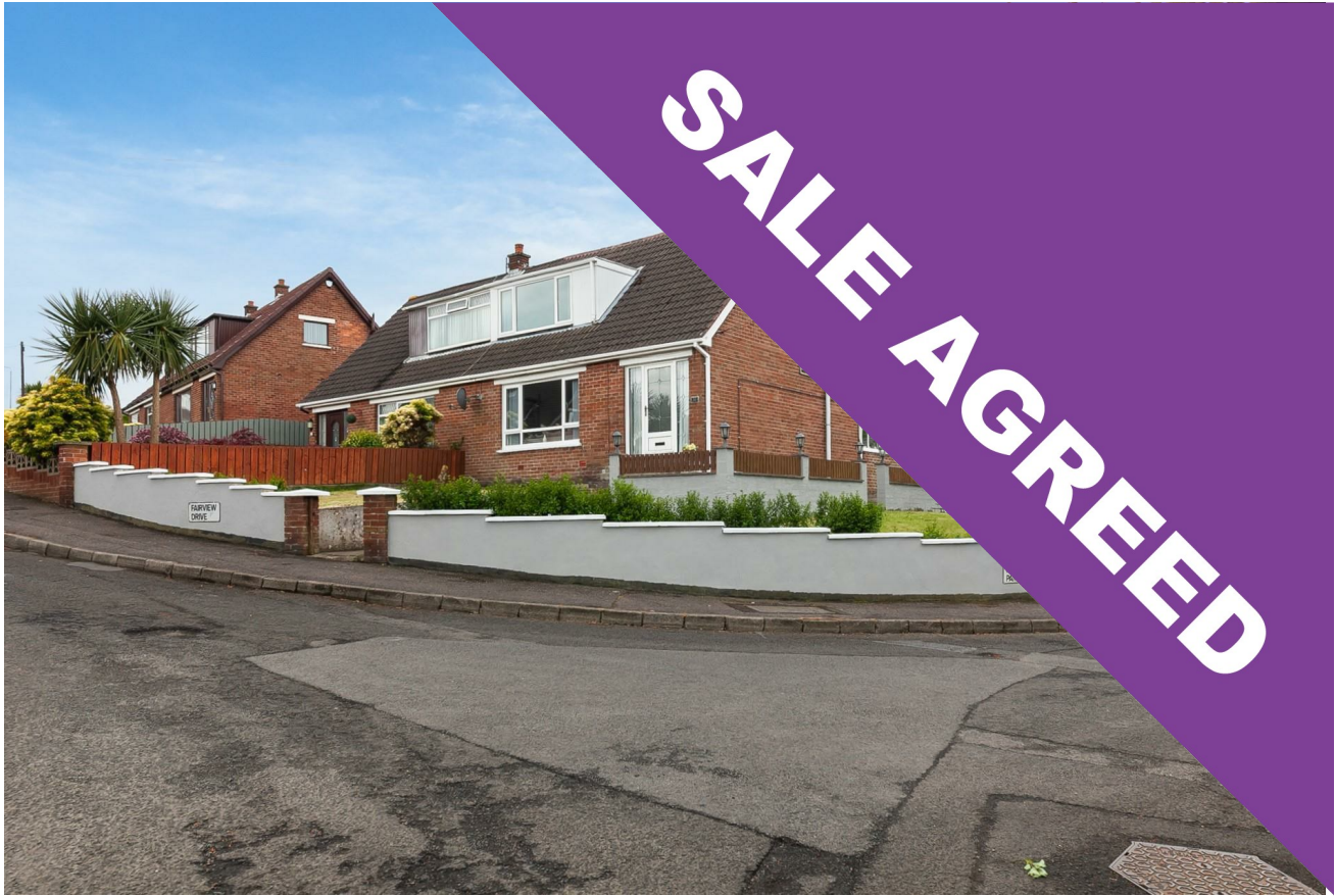
32 Fairview Drive, Newtownabbey, BT36 6PS