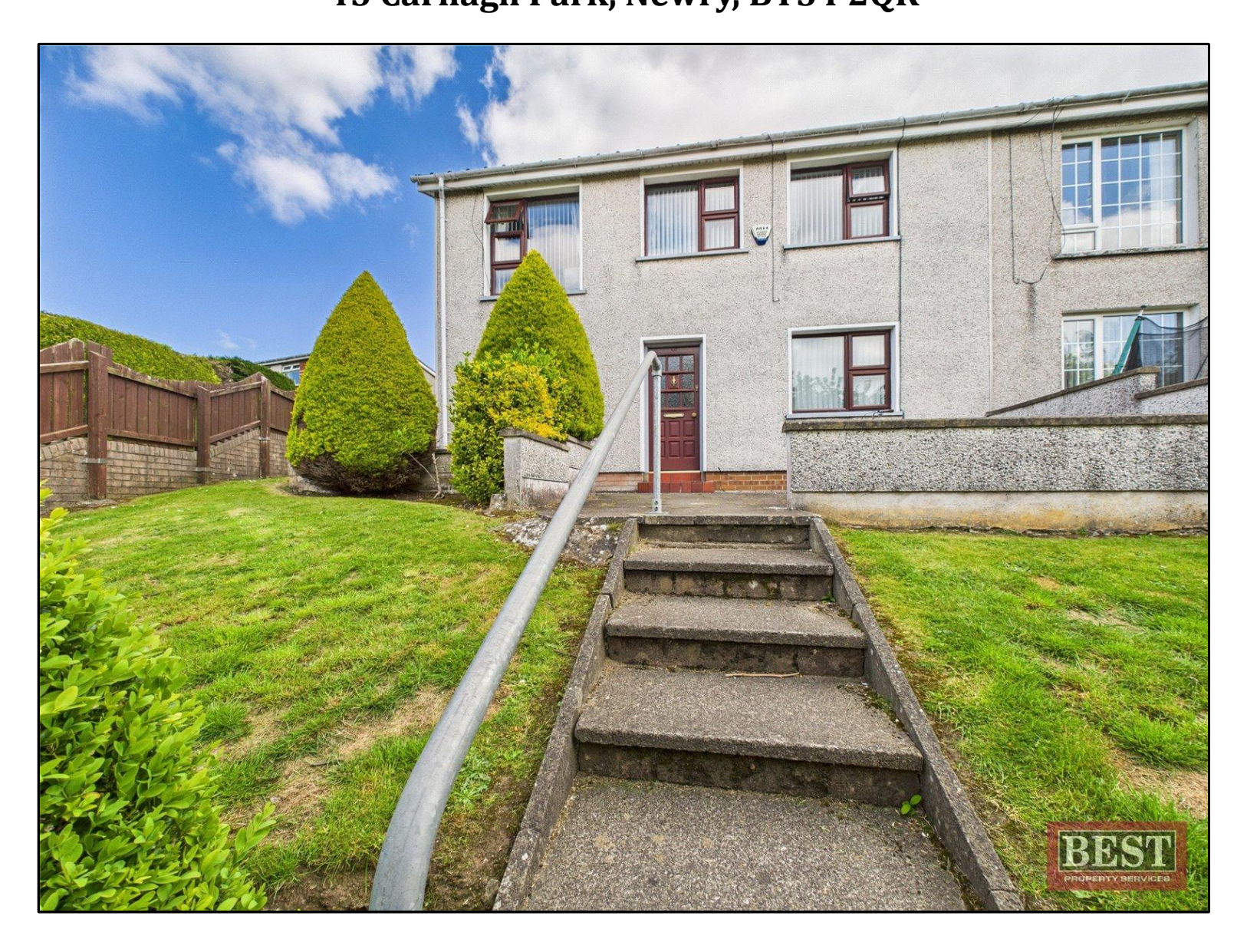
Asking Price £155,000