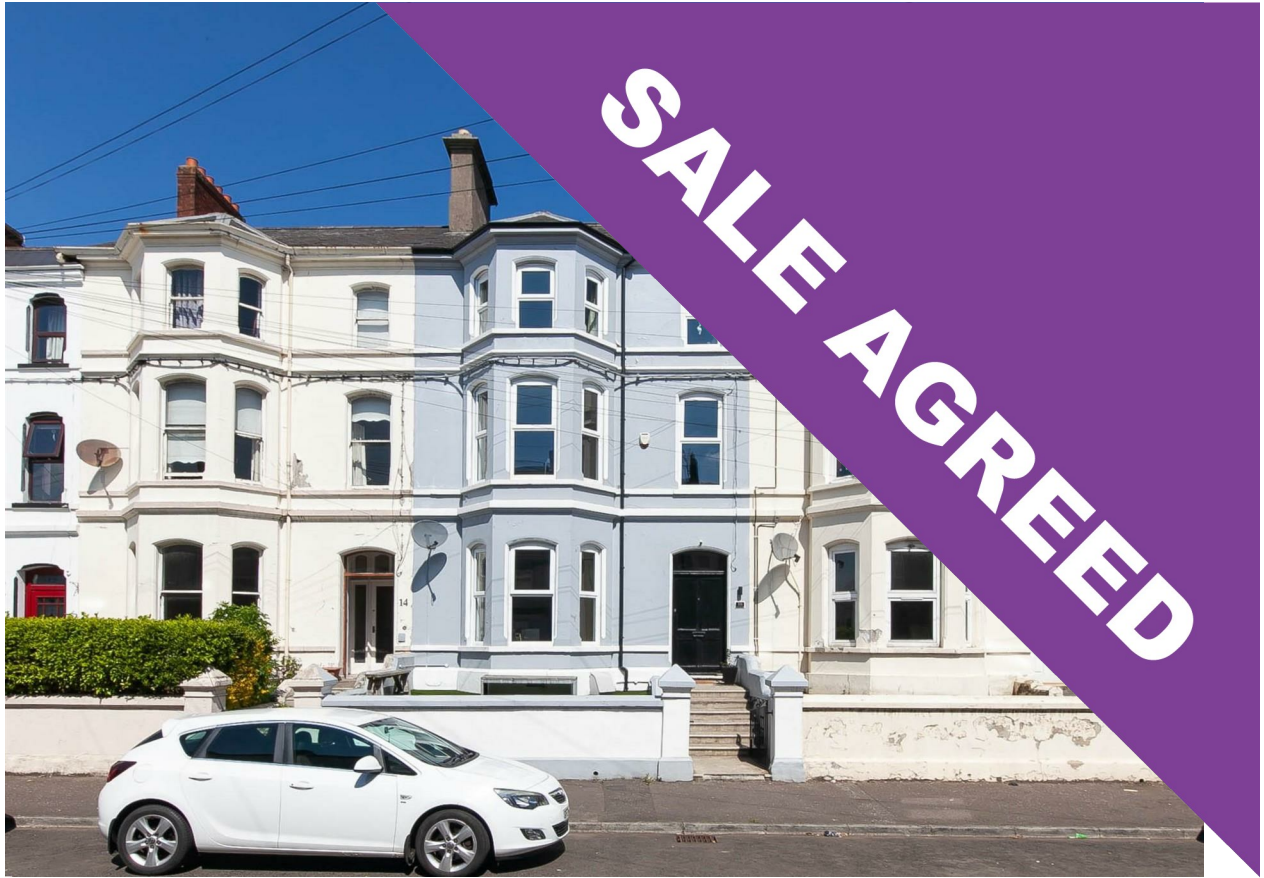
16 Curran Road, Larne, BT40 1BU