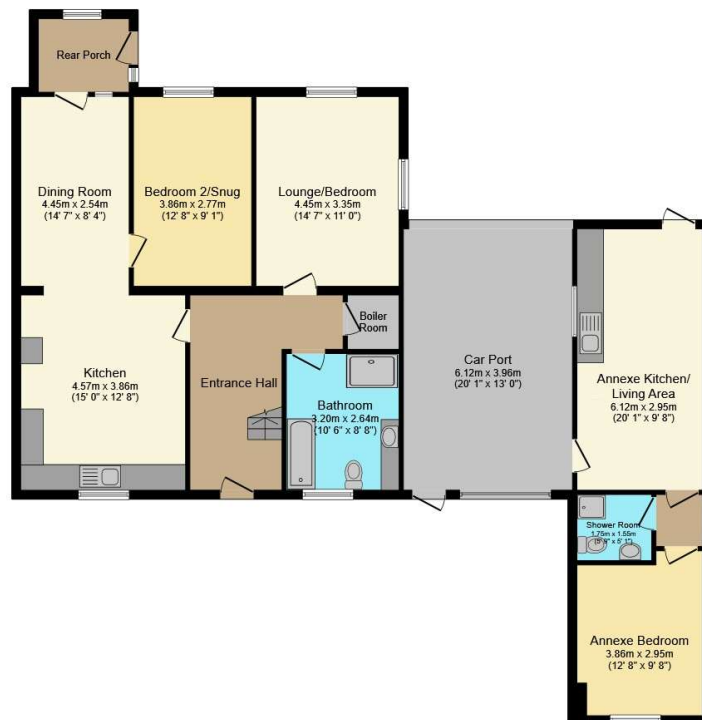
Ground Floor Floor area 120.4 sq.m. (1,296 sq.ft.)