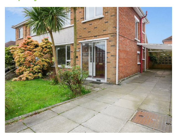
Garden to front with laid lawn and driveway to the side with off street parking.