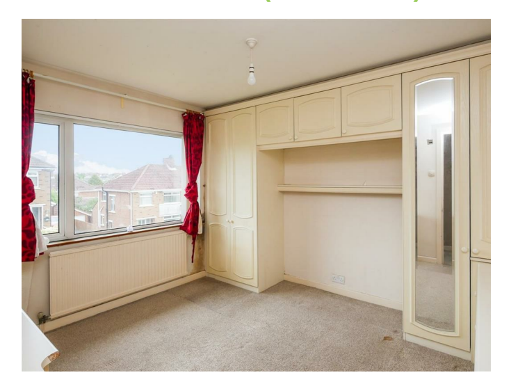
Built-in wardrobes and drawers.