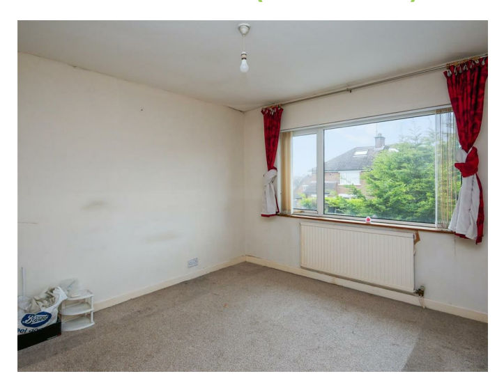
Bedroom 2 11'2" x 10'6" (3.41m x 3.21m)