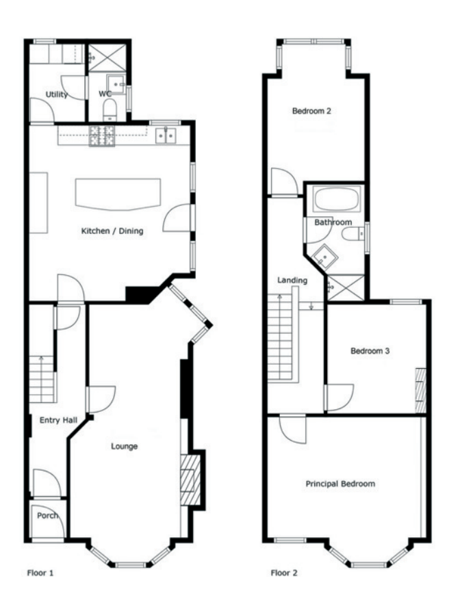
Sizes And Dimensions Are Approximate. Actual May Vary.

Heading out of Belfast on the Upper Newtownards Road, turn left on to Earlswood Road, just after the Sandown Road traffic lights. Property on the left.