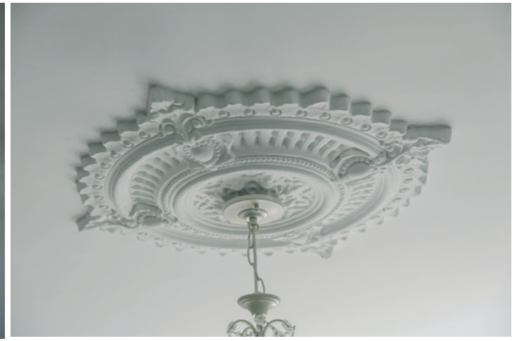
BEDROOM (1): 15' 2" \times 14' 3" (4.62m \times 4.34m) (into bay). Cornice ceiling, low voltage spotlights, feature wood panelling.