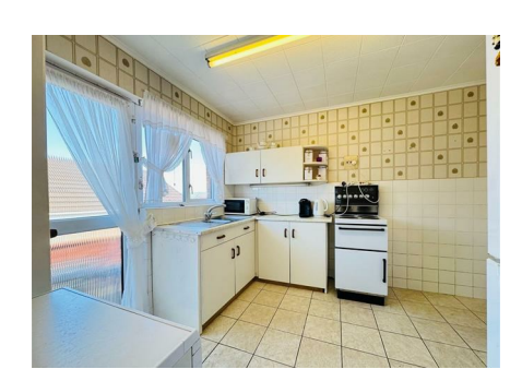
14 Beverley Park Carnmoney, Newtownabbey, BT36 6NR