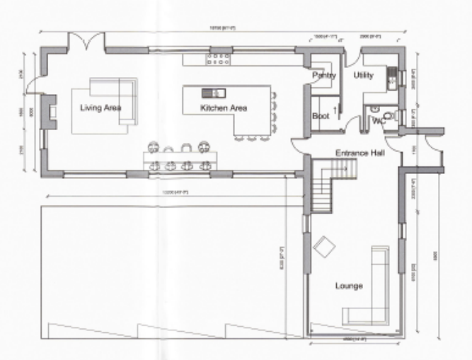
Upper Floor 146msq Gross Internal