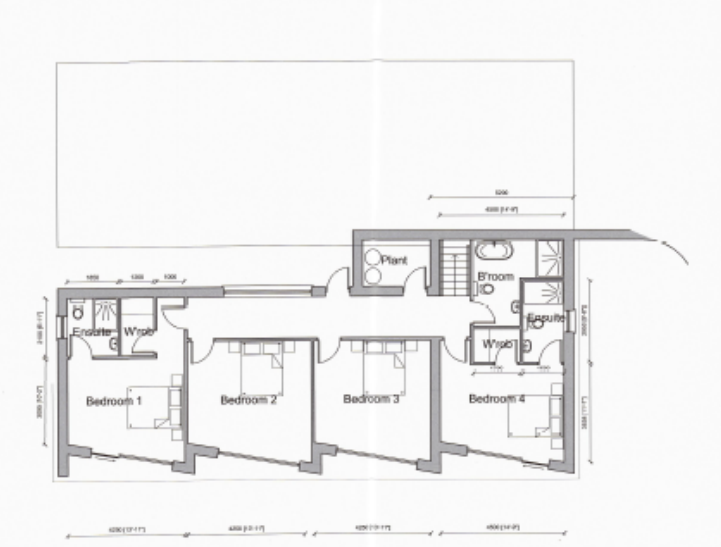
Lower Floor 120msq Gross Internal