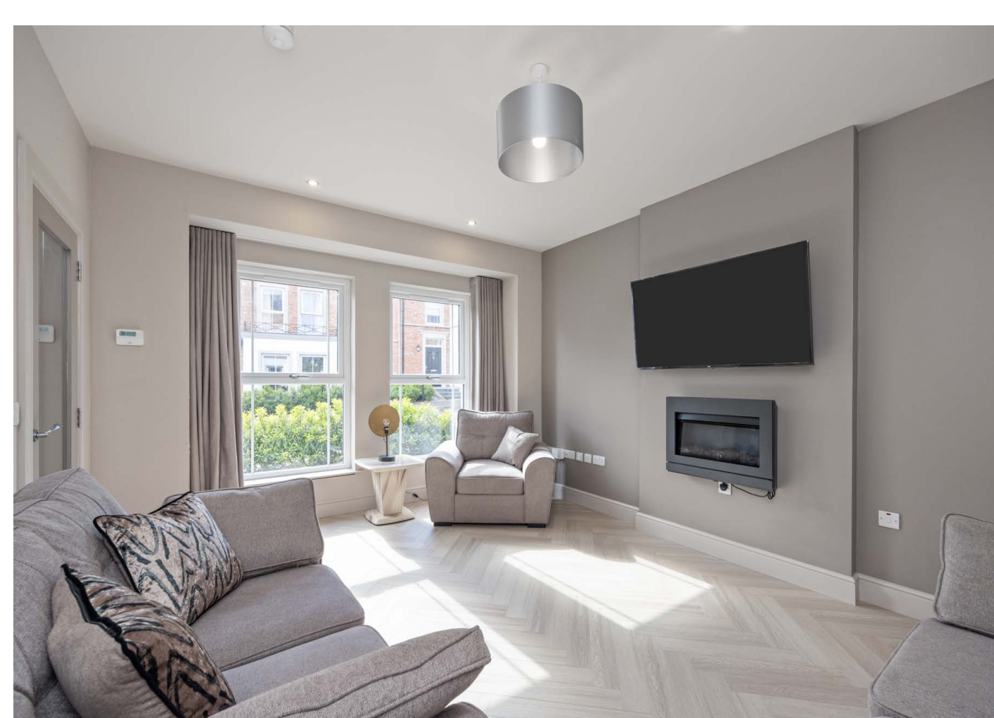
Drawing room EXPERIENCE | EXPERTISE | RESULTS