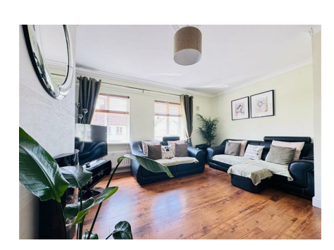
1 Altmore Green Rathcoole, Newtownabbey, BT37 9AX