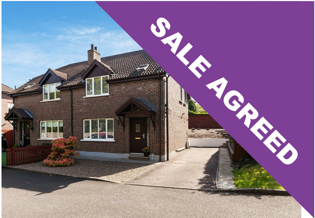
23 Collinward Drive, Newtownabbey, BT36 6DR