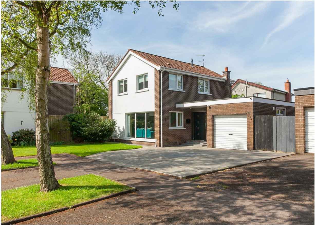
109 Ashgreen, Antrim, BT41 1HN