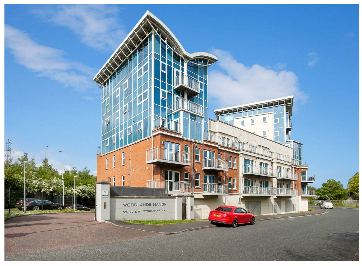
Apt 5 Woodlands Manor, 59 Stockmans Way, Belfast, BT9 7GL