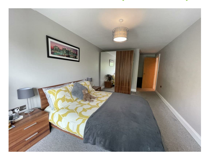
Door to balcony.