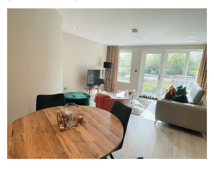
Door to balcony. Laminate wood flooring