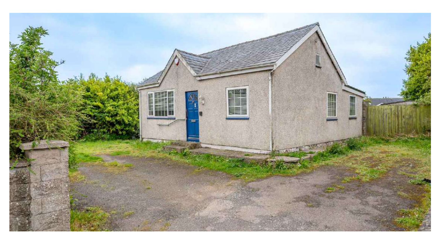
DETACHED BUNGALOW | 3 ⊨ | 1 ≒ | 1 ⊟

Located in the desirable coastal village of Millisle, this detached bungalow offers a rare opportunity for those seeking a full renovation or redevelopment project. With no onward chain and convenient access to the village amenities.