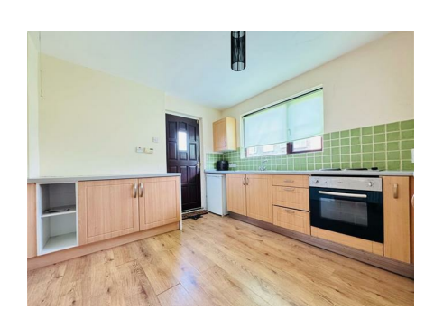
7 Ravelston Drive Carnmoney, Newtownabbey, BT36 6PG