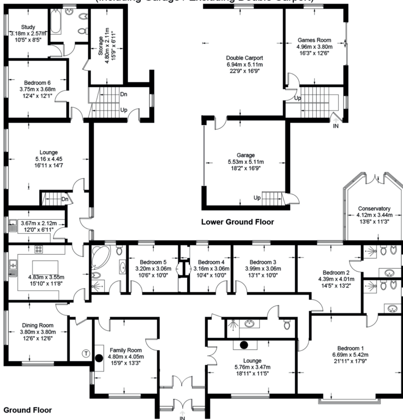
Illustration for identification purposes only, measurements are approximate, not to scale. (ID1192550)

The above details do not constitute any part of an offer or contract. None of the statements contained in this sales brochure is to be relied on as statements or representations of fact and any intending purchaser must satisfy himself by inspection or otherwise as to their correctness. Neither the vendor, nor Henry Graham Estate Agents, nor any person employed in the company has any authority to make or give any representation or warranty whatsoever in relation to this property. All dimensions are approximate and are taken at widest points.