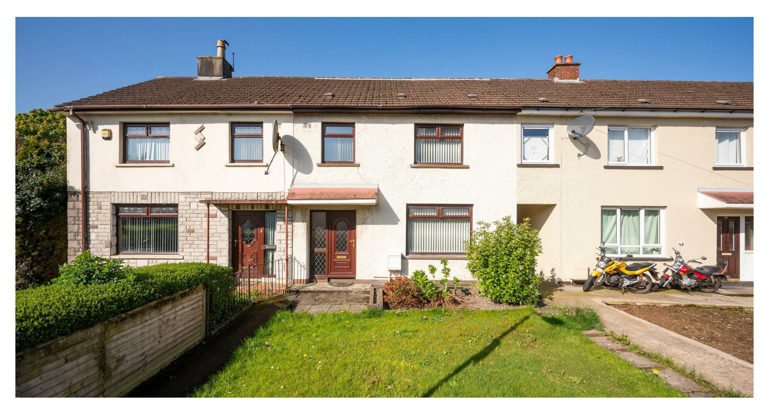
HOUSE - TERRACED | 3 ⊨ | N 🗗 | 1 🖃