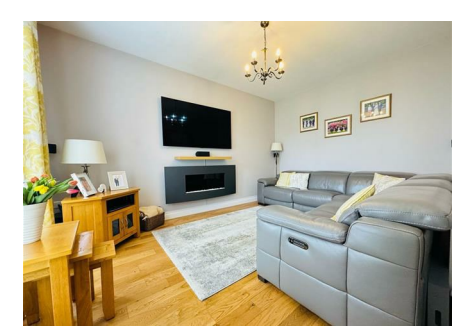
17 Blackrock Walk Hydepark Road, Newtownabbey, BT36 4AQ