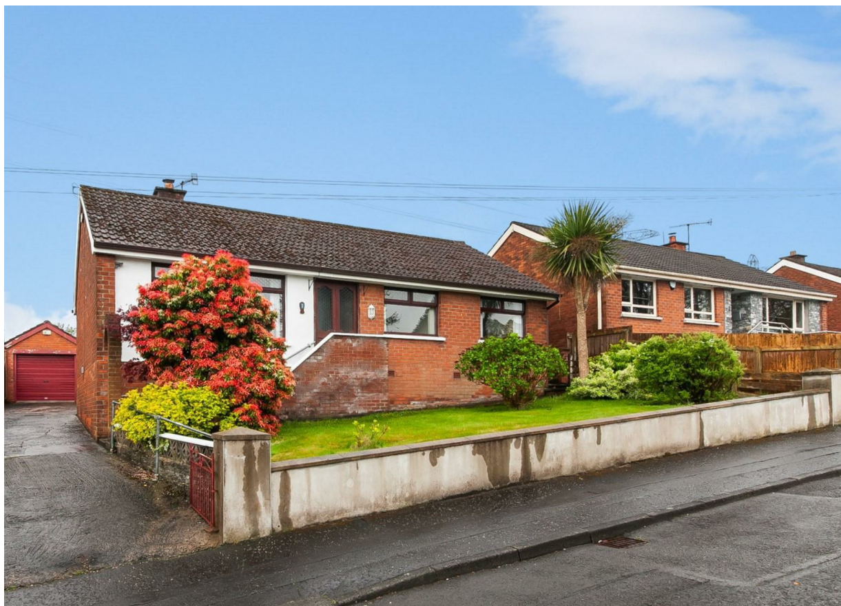
7 Waverley Drive, Newtownabbey, BT36 6RX