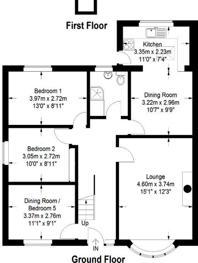
Illustration for identification purposes only, measurements are approximate, not to scale. FloorplansuSketch.com © 2015 (ID171585)