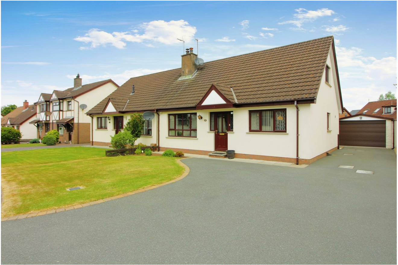
34 Millview Drive, Ballyclare, BT39 9YB