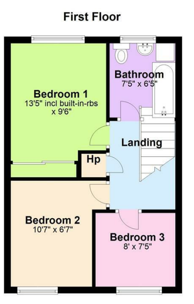
8 Whitethorn Lane, Kinallen, Dromara Dromore