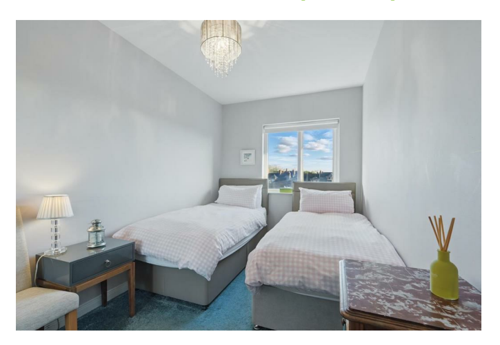
Sliding built in robe.