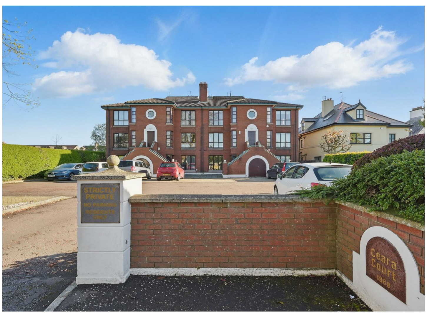
11 Ceara Court, 46 Windsor Avenue, Belfast, BT9 6EJ