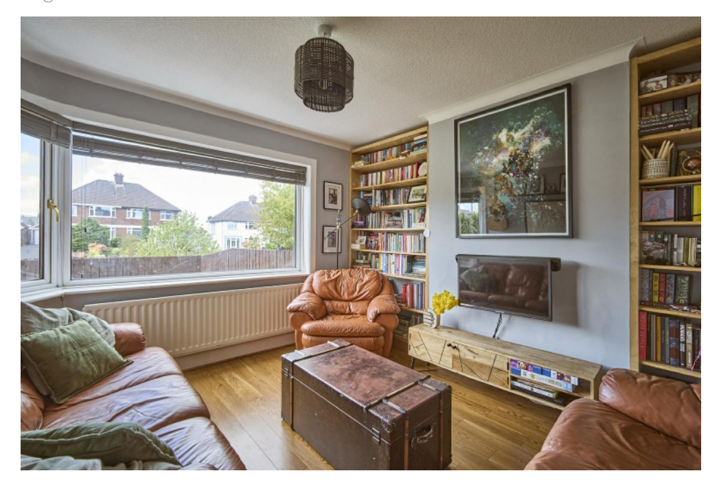
EXTENDED DINING ROOM/FAMILY AREA: 19' 0" \times 10' 6" (5.8m \times 3.2m) (at widest points). uPVC double glazed patio doors to garden.

LOUNGE: 12' 2" \times 11' 2" (3.7m \times 3.4m) Oak laminate wooden flooring, built-in book shelving. Cornice ceiling.