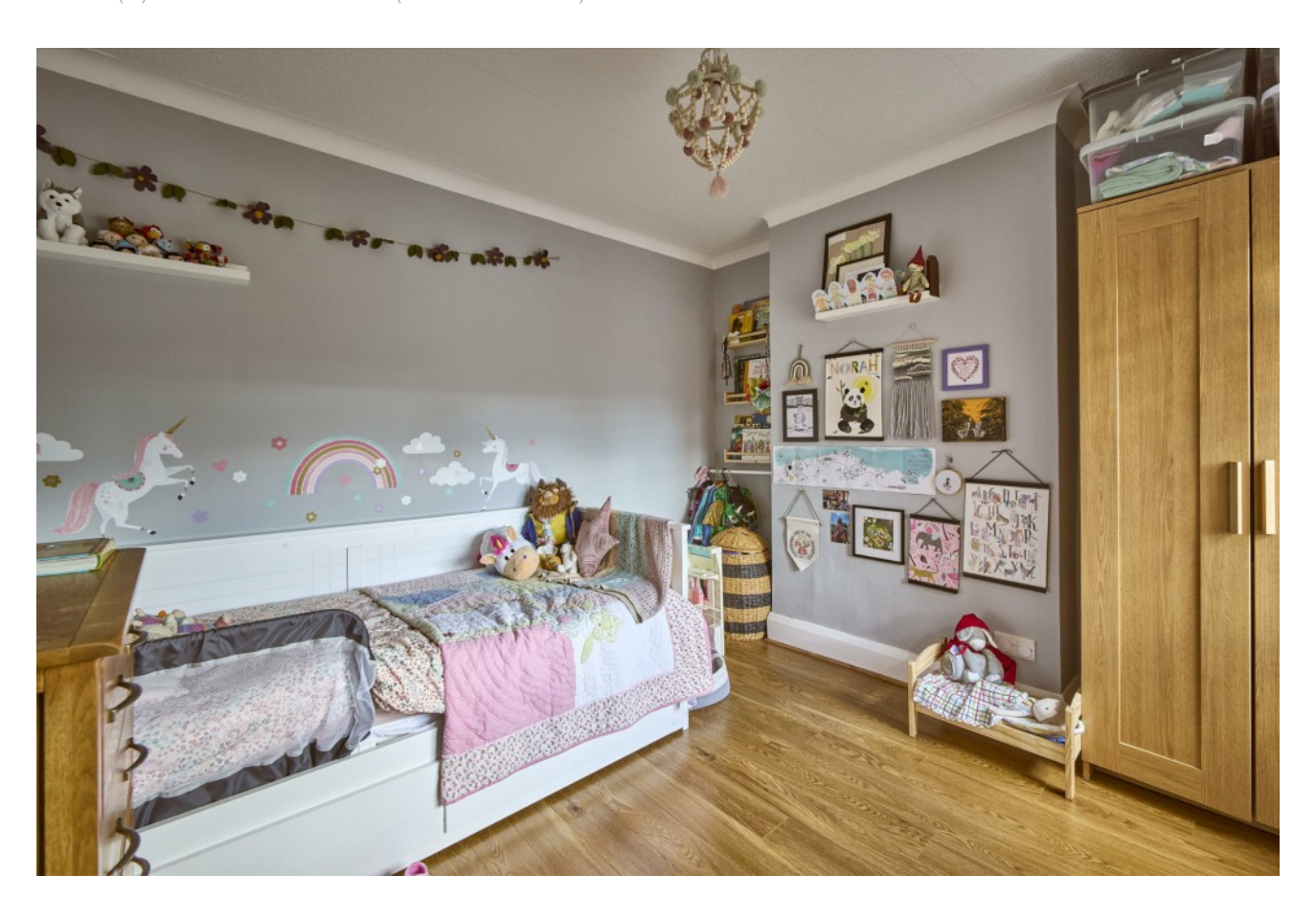
BEDROOM (3): 9' 2" x 7' 10" (2.8m x 2.4m) Oak laminate wooden floor.