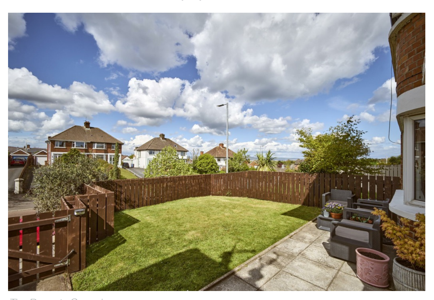
The Property Comprises: