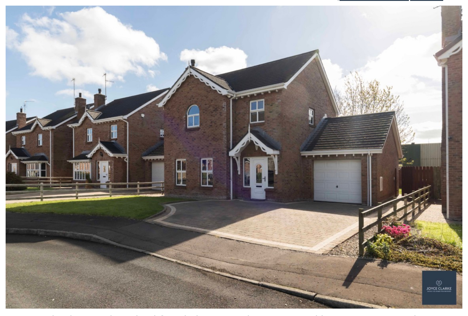
Four bedroom detached family home with garage and large private garden to the rear