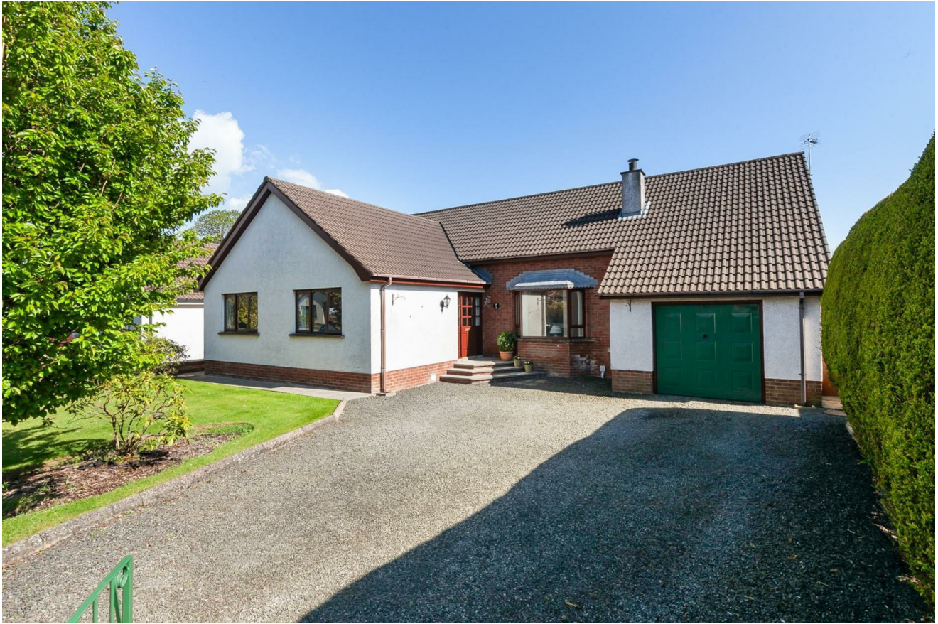
8 Merion Park, Ballyclare, BT39 9XD