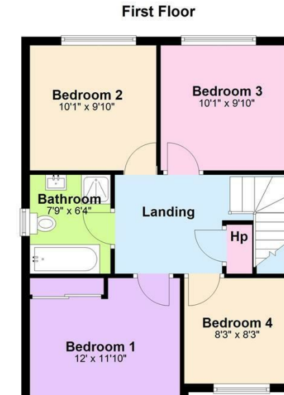
37 The Belfry, Dromore