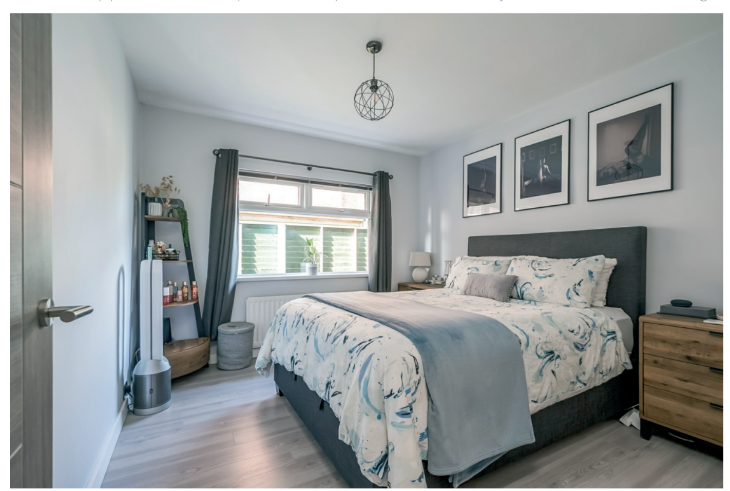
BEDROOM (2): 11' 2" x 8' 10" (3.4m x 2.7m) Grey oak effect laminate flooring. Outlook to side.